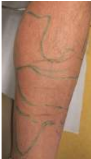
Figure 3. This 49-year-old man is a poor candidate for leg hair extraction because of complete hair loss in most areas. In the areas with hair, the hair is also vellous-looking with densities below 8 per cm 2 .

spread of \geq 8 per cm 2 (Figure 1) is of good quality for transplantation. Patchy areas of hair, regardless of location on the body, are to be avoided. For example, Figure 2 shows a patient's abdomen in which the areas marked with an X have densities less than 8 per cm 2 compared with the circled area, which shows a higher density and more uniform hair spread. In practice, it is common to demarcate areas from a specific body location area into viable vs nonviable sources. Figure 3 shows an example in which the legs have totally nonviable hair sources because of complete hair loss in most areas; in those areas with hair, the hair is vellous-looking and has an unsatisfactory density.