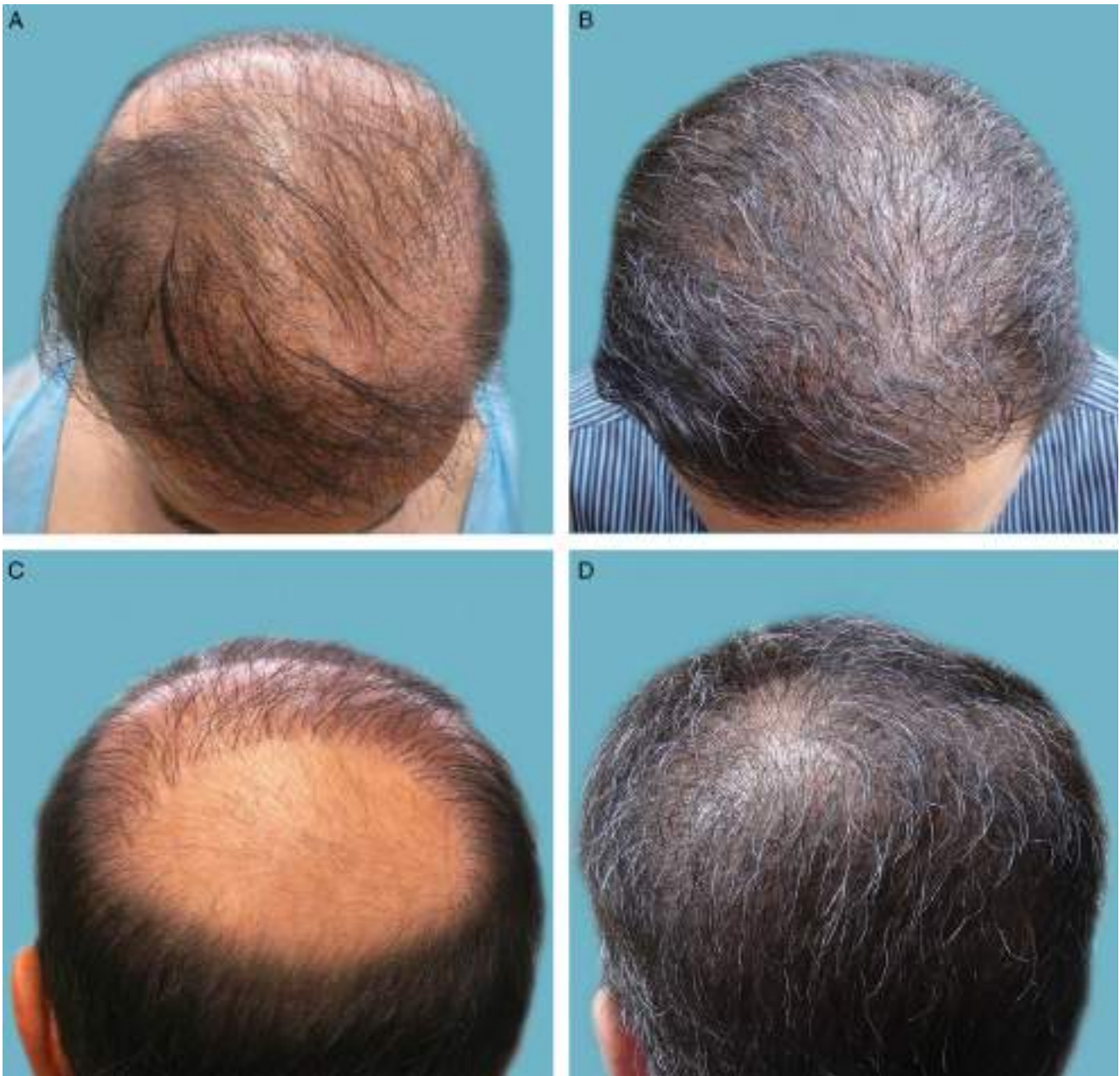
Figure 6. (A, C) Preoperative and (B, D) 12-month postoperative photographs of a 46-year-old man. The preoperative bird's eye view (A) shows multiple failed attempts at hair restoration with head donor surgeries and the preoperative crown view (C) shows a mostly bald area with surrounding pluggy, misplaced rows of hair. The postoperative photographs demonstrate a hairline (B) repaired with mainly chest hair to fullness and a softer look and a completely restored crown view (D) after transfer of 14,000 grafts from head and beard.

and overall satisfaction with the results. For healing status, the mean score was nearly as high for beard-involved donor BHT patients (8.7) as head and NPA-involved donor BHT patients (8.9). Incidentally, the overall satisfaction score with BHT in this study regardless of donor source (8.3) was the same as the overall satisfaction score achieved when only finer head hairs from the NPA areas were used to create softer hairlines and temples (8.3). 18