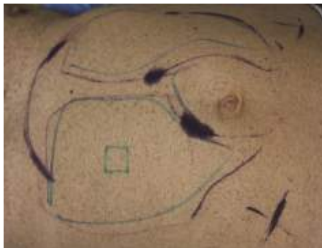
Figure 2. Viable and nonviable areas of donor hair extraction in the abdominal area demonstrated on this 40-year-old man. The uniformity and density of hair within the encircled area is satisfactory, but the lower abdominal areas indicated by the X are not.

(BHR) describes use of head or body hair in areas of loss in nonscalp areas (such as pubic or eyebrow hair restoration or eyelashes). 8-14 Body hair from the beard, trunk, and the extremities can be transplanted by follicular unit extraction (FUE) methods and combined with head hair, if available, to cover both scalp and nonscalp areas to improve severe baldness, 1 create more natural and softer hairlines, 5 repair donor strip scars from previous hair restoration surgeries, 6 and restore facial and body hair. 8-13