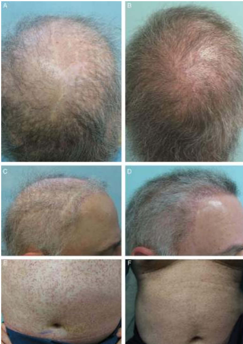
Figure 7. (A, C) Preoperative and (B, D) 6-month postoperative photographs of this 58-year-old man. This patient is an example of severe baldness compounded by exhaustion of head hair donor sites due to previous hair transplantation surgeries. Linear scars of scalp reduction (in crown) and 4 mm punch scars are visible in the occipital and parietal regions (A). In addition to severe thinning, there are linear scars from past temporoparieto-occipital flap surgery in the hairline and temples as well as 4 mm punch excision scars in the parietal regions (C). The postoperative photographs show much improved coverage for the crown of the head and camouflaging of prior surgical scars and aesthetically pleasing hairline and temple coverage (B), as well as the obfuscation of the linear scars in the hairline and temples (D). The patient's abdominal area a few days after body hair extractions (E) and the abdominal region showing healed BHT extraction area about 3 months postoperatively (F). On very close examination, insignificant white dots are visible.