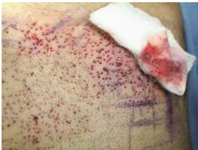
Figure 4. After the “FUE swipe maneuver,” the wet gauze retains most of the grafts that have been completely separated from tissue prior to any mechanical separation by the surgeon. Some grafts are also found laying on the skin surface free of any tissue attachments.

separated from all tissue attachments. It is possible that these grafts are susceptible to ischemia and desiccation at a faster rate than grafts with residual attachments to the surrounding tissue, which require hypodermic needle separation. Consequently, a simple procedure (“FUE swipe maneuver”) was devised to rapidly identify these follicles and to remove and store them in physiologic media separately ahead of attached grafts. The procedure entails rubbing wet gauze over the donor areas soon after 50 to 100 follicles have been scored. This maneuver typically removes most of these free grafts (Figure 4). Although the relationship between graft survival and time between scoring and actual removal of grafts has not been well studied, biochemical evidence would suggest that this time should be minimized. 21 For recipient grafting, slits were created by means of blades custom-sized to the dimensions of the extracted grafts.