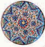
Iznik-style plate, Cavalry Bazaar

Whether you want to lose yourself in the aromas of exotic spices, rummage for old prints and miniatures among secondhand books, hunt for souvenirs or just shop for food, you will find a market or bazaar catering to your tastes somewhere in Istanbul. An obvious first stop is the Grand Bazaar, but several others are well worth visiting for their more specialized produce and their atmospheric settings. Every neighbourhood in Istanbul has its own open-air market on a specific day of the week. At these markets, crowded with budget-conscious housewives, you will find a huge variety of merchandise at the cheapest possible prices.