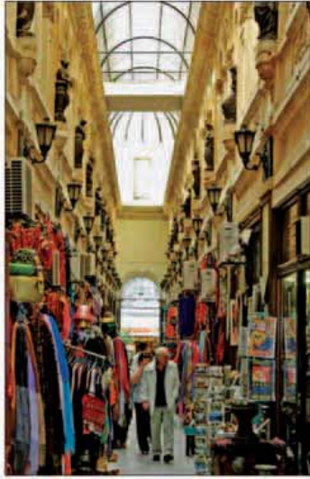
Avrupa Pasajı bazaar ⑥

It was in the Pera district that Constantinople's cosmopolitan population lived and worked in the 19th century, where the embassies and palatial residences mirrored the lifestyle of Topkapı Palace, on the opposite side of the Golden Horn. Once known as the "Paris of the East", life centred on the main street of Pera, today's İstiklâl Caddesi. Even today the Avrupa Pasajı and Balık Pazar markets seem wistfully unchanged, especially when contrasted with the remarkable Pera Museum and the sophisticated Istanbul Modern Art Museum.