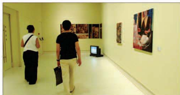
Pera Museum ⑧

continue left down the hill until you reach Tomtom Kaptan Mosque ⑬. The 17th-century fountain here, which was once a grand landmark, is now sadly neglected.