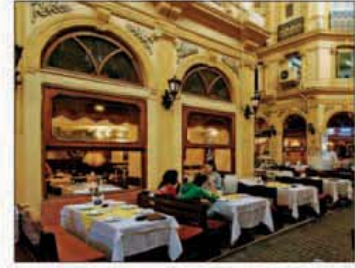
A Çiçek Pasajı restaurant ④

Turn right and then left onto Meşrutiyet Caddesi and follow the road around to the left with the British Consulate General ⑦ on your right. Follow this street down, past TRT (Turkish Radio and Television) and the celebrated but now faded Grand Hotel de Londres until