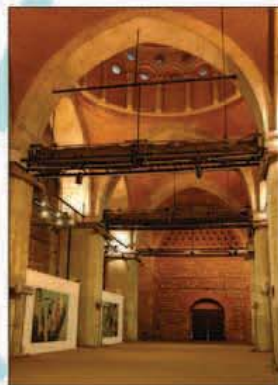
Interior of the Tophane foundry ⑮

Take the steep cobbled street that descends beside the Turkish baths, Çapanoğlu Sokak, which becomes a staircase at the bottom. Turn right onto Harbiye Sokak and you will reach French Street, or Fransız Sokağı ⑫ on the left, where an elegant French ambience meets classy Beyoğlu. Enjoy lunch or a glass of wine at one of the French-style cafés.