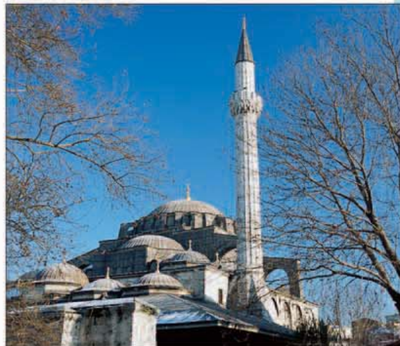
Dome of the Kılıç Ali Paşa Mosque ⑩