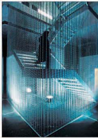
Istanbul Modern Art Museum ⑩

Take the second right onto Tornacıbaşı Sokak,