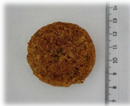
Figure 2. Falafel pie.

Falafel is a Jordanian popular food composed of chickpeas, parsley, onion, garlic, salt, and sodium bicarbonate and served after frying in palm or soybean oils for 3 min [6] [7].