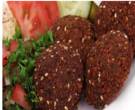
Figure 4. Egyptian Falafel Ta'amiya.