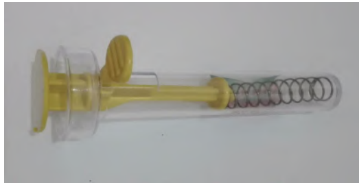
Figure 7. This is the modern which shows its mechanism.

On the other hand, others believe that Falafel was first known to the Syrians in the middle ages, and it has spreaded in the country of Jordan, Palestine, Lebanon and Egypt through trade trips between those countries, subsequently to move to all other countries through travelers who liked its Syrian taste. Others believe that falafel is known, the first time, in Palestine, and have evolved over time to acquire its current form, and this view is supported by a number of Palestinians scholars.