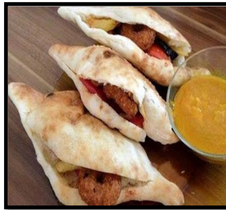
Figure 5. Iraqi Falafel Sandwich.

It is said that Egyptians are the first people who knew bean plant and have it as a human food, and they confirm that Falafel is an Egyptian invention one hundred percent. They also approve that by referring to the origin of the name, the word Falafel is an Egyptian word inherently derived from the word “Pepper”, which explains the chili taste which is one of the characteristic of the Egyptian falafel. While the other name of the Falafel which is Ta'amiya is also openly endorsed it by a large number of Egyptians and say that it comes from the Egyptian dialect which derived from the Arabic word “ta'am” which means “taste”. The Egyptians Chefs also confirm that the Pharaohs were the first to know Falafel or Ta'amiya, and they had stuffed it with many fillings to add more nutritional value to it, for example it was stuffed with liver or meat and sometimes eggs, to the extent that it became as a companion to the ancient Egyptian in his travels for its ability to fill the hunger [8].