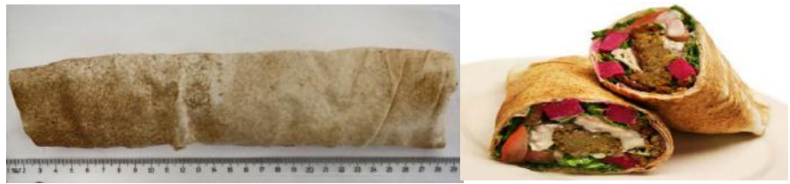
Figure 3. Syrian Falafel Sandwich.